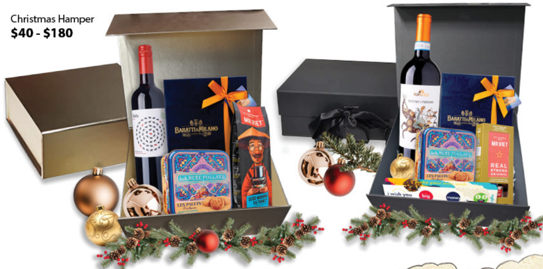
Christmas Hamper $40 - $180