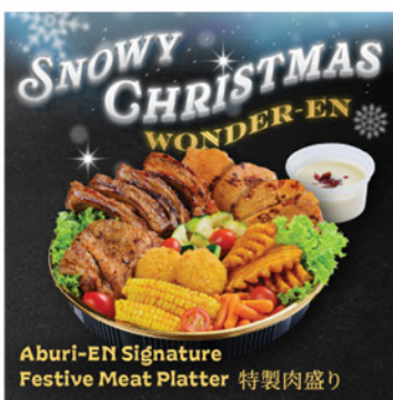
Aburi-EN Signature Festive Meat Platter 特製肉盛り