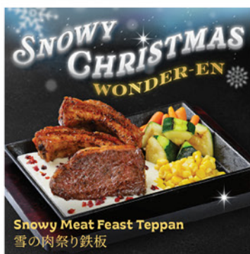
Snowy Meat Feast Teppan 雪の肉祭り鉄板