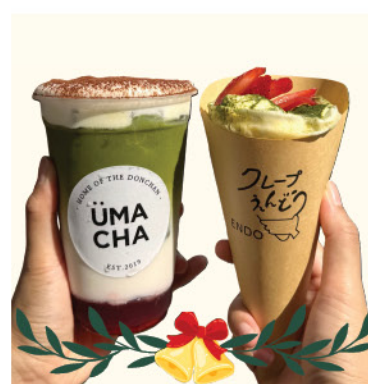
CREPE ENDO X UMACHA Isetan Scotts Level 1

Enjoy the festive season with Matcha & Strawberry drinks and crepes!