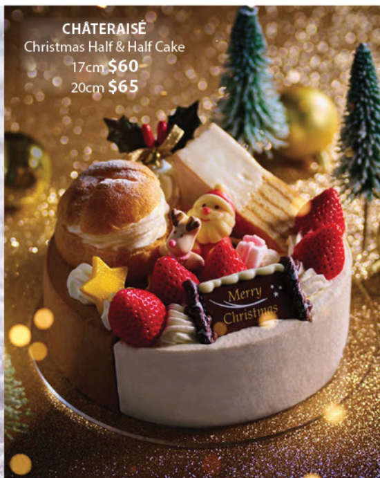
CHATERAISE Christmas Half & Half Cake 17cm $60 20cm $65