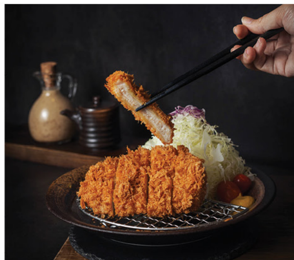
TONKICHI Isetan Scotts Level 4

A premium take on the classic tonkatsu, our Shirobuta Katsu is made using Hokkaido Shirobuta pork. Renowned for its quality, with a good balance of lean meat and fat, resulting in a tender and flavorful experience. Coated in crispy panko and deep-fried to golden perfection, it's a true indulgence for katsu lovers who appreciate quality and craftsmanship.