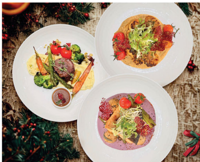
CAFÉ DE MUSE Isetan Scotts Level 1

Venture out this season at Isetan Scotts. Enjoy festive dining experiences that fill every moment with warmth, flavour, and holiday cheer!