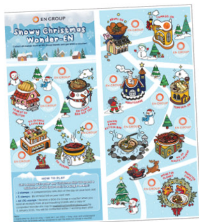
Snowy Christmas Wonder-EN

*For takeaway & delivery. Delivery prices vary.