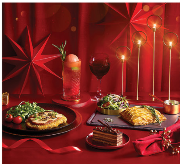
TCC - THE CONNOISSEUR CONCERTO Isetan Scotts Level 2

Discover the joy of the season with our festive spread — nori-crusted Chicken Parmigiana, golden Salmon En Croûte, decadent Noël Choco Crunch log cake, sparkling Christmas blend – Snowberry Bliss, crafted to delight every celebration. Gather, savour and make every moment merry.