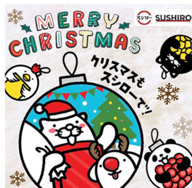
SUSHIRO Isetan Scotts Level 3

Experience the joy of Christmas with Sushiro's seasonal delights. From freshly made sushi to warm cooked savoury dishes and sweet desserts, there's no better way to savour the season than with sushi made fresh from the heart!