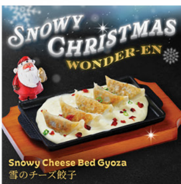
Snowy Cheese Bed Gyoza 雪のチーズ餃子