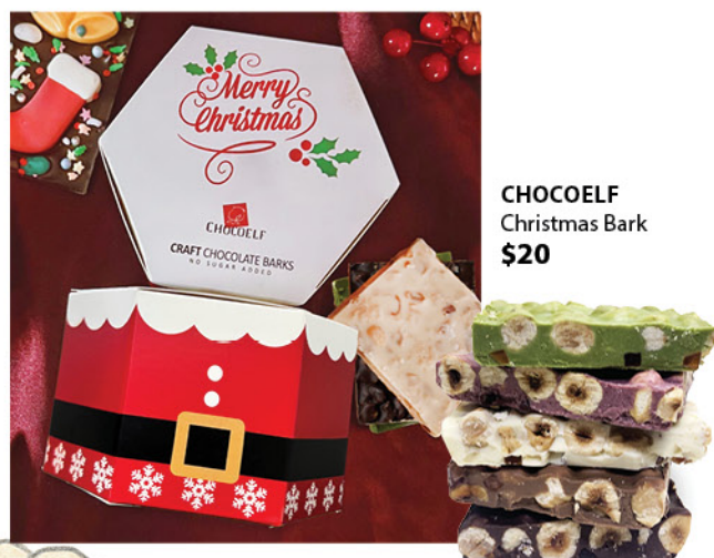
CHOCOELF Christmas Bark $20