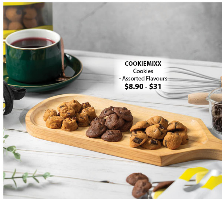
COOKIEMIXX Cookies - Assorted Flavours $8.90 - $31