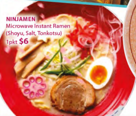
NINJAMEN Microwave Instant Ramen (Shoyu, Salt, Tonkotsu) 1pkt $6