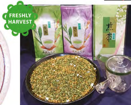
FUKUSA TEA Fukuoka Yame Tea (Deep Steamed Tea) 100g $32 Fukuoka Genmai Tea (Brown Rice Tea) 200g $18