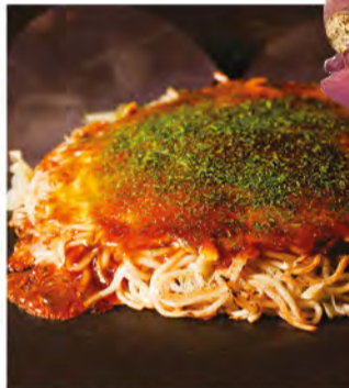
NEW! UTAGE Hiroshima Yaki 1pc $10