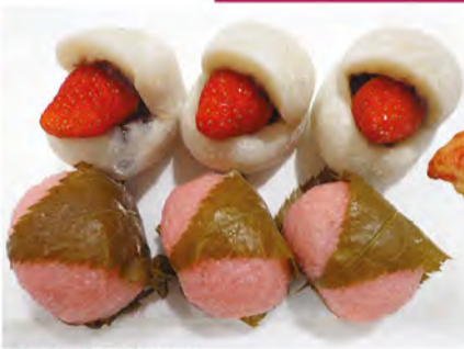
MEGURO SHOKUJIN Strawberry Daifuku 1pc $4.50