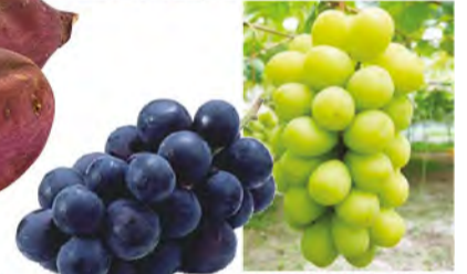
JAPAN PRODUCE Japanese Kyoho Grape 1pkt $28 Japanese Shine Muscat 1pkt $48