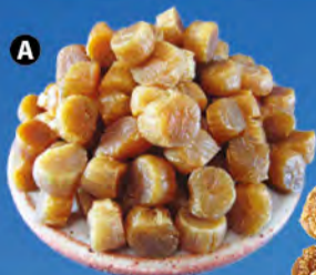
KANEKO BUSSAN A. Dried Scallop (L) per 100g $125 B. Dried Abalone per 100g $85 C. Dried Sea Cucumber per 100g $95