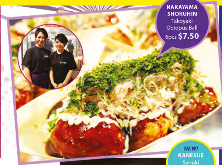
NAKAYAMA SHOKUJIN Takoyaki Octopus Ball 6pcs $7.50