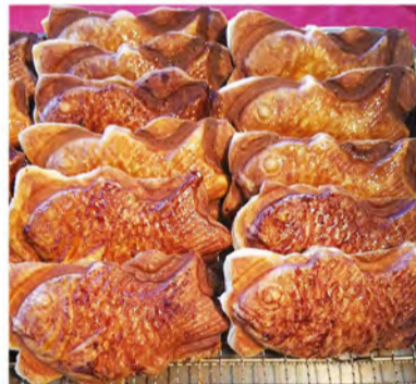
NEW! ARASHIYAMA LE. MANS Danish Taiyaki 1pc $4.50