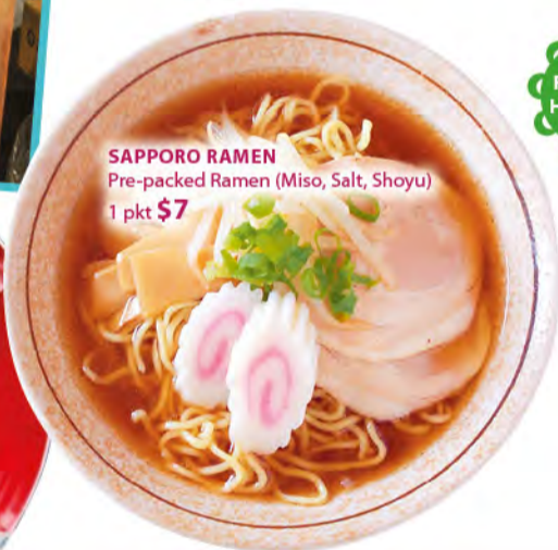
SAPPORO RAMEN Pre-packed Ramen (Miso, Salt, Shoyu) 1 pkt $7