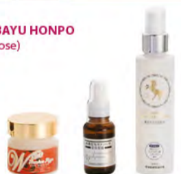
HOKKAIDO JUNBAYU HONPO Pure White Q10 (Rose) 65g $63 Horse Ceramide Beauty Serum 30ml $115 Natural Ceramide Lotion 150ml $65