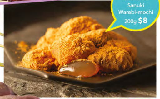
NEW! KANESUE Sanuki Warabi-mochi 200g $8