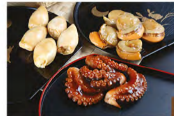
IJIMA SHOTEN Braised Seafood per 100g $7.80