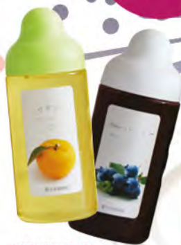
SUGI YOHOEN Yuzu/Blueberry Honey 500ml $30