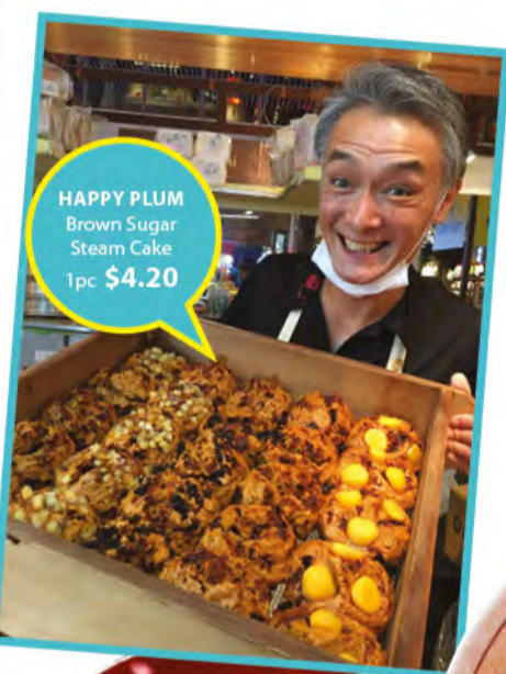
HAPPY PLUM Brown Sugar Steam Cake 1pc $4.20