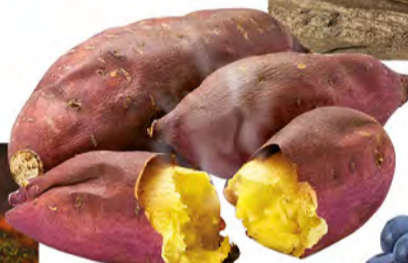
JAPAN PRODUCE Baked Sweet Potato per 100g $2