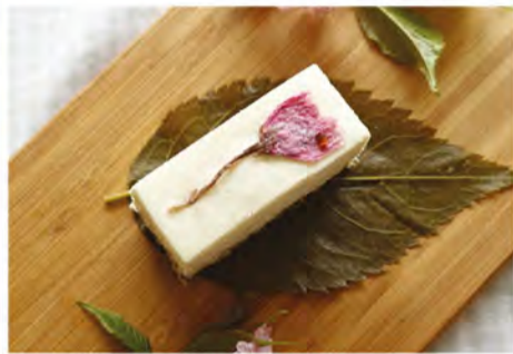
NEW! KOGANEI CHEESECAKE Sakura Honey Cheesecake 1pc $5.50