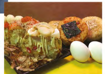
SATOHORU Dosankoyaki 1pc $5