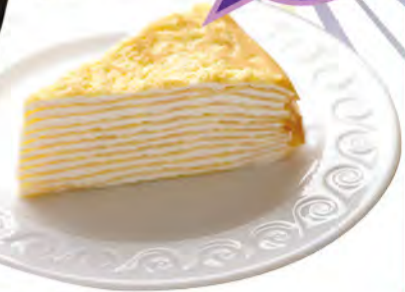
HOKKAIDO KOKUBO Hokkaido Mille Crepe (Vanilla, Matcha) 4pcs $13.90